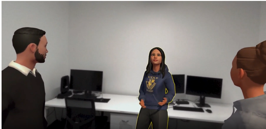
Fig. 2. An example visualisation simulating a roleplay created by the system. The current speaker is highlighted in yellow to improve clarity for the viewer. The viewer can move around the environment to view the situation, and the system uses spatial audio to improve the ability of the viewer to track the conversation.

Following the roleplay sessions, participants could review their performance using a Varjo XR-3 augmented reality headset. The replay environment offered three options: the real world, a digital twin background replicating the physical setting (if one existed for the location), or a generic background for the simulation (e.g. an office or a classroom). The body movements of the roleplay participants were mapped onto virtual avatars chosen by the participants before the roleplay. An example of this roleplay being visualised through the AR headset can be found in Figure 2 below.