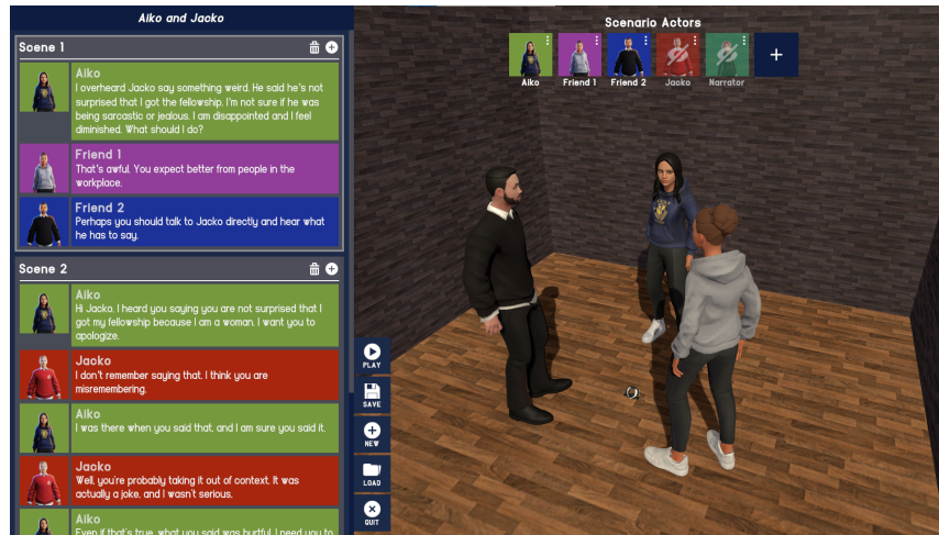
Fig. 5. The Roleplay Planner provides tools to help users construct their roleplay and make changes as necessary. Users can select the avatars they want to use, the voices they want the avatars to have, and the dialogue they want the avatars to speak. They can then watch a simulation of the scenario and make adjustments as needed. When they are happy with the scenario, then can then use the Roleplay Mirror to act out the scenario and add their own animations to the recording.

cameras were strategically placed around the room at different angles to significantly improve overall tracking precision. We also again updated the body tracking model to instead use 38-keypoint tracking, improving the hand tracking capabilities of the system once more.