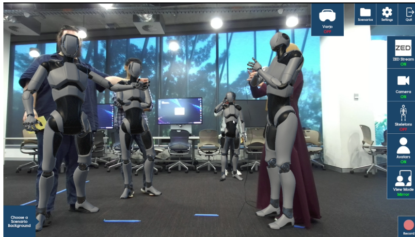
Fig. 3. This is an example of the Roleplay Mirror as viewed from the perspective of the users. Due to the position of the camera on the screen, it would act as a digital mirror, performing the actions on the assigned avatars in realtime. Note that during the roleplay, a clean frame is used to "hide" the participants, and the UI is also hidden to remove distractions.

We initially considered using voice actors to record the dialogue from the roleplays to explore how participants would respond to the removal of their own voices. However, this approach proved cumbersome to implement and lacked scalability.